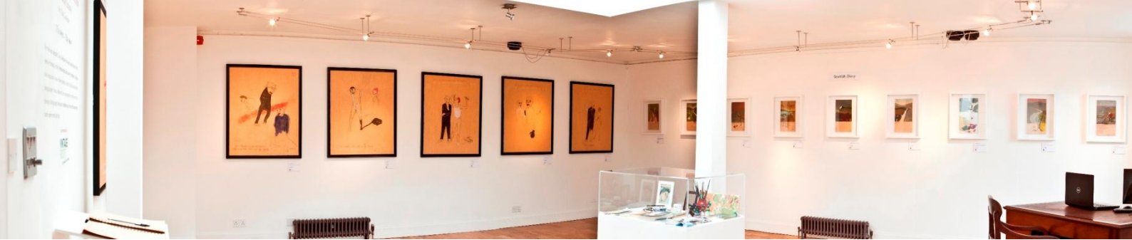
Life, Words and Coincidences, Henderson Gallery, May 2010, Edinburgh